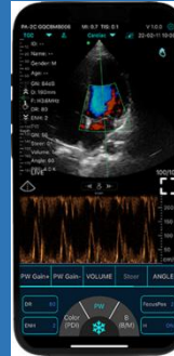
1 MOBILE PHONE